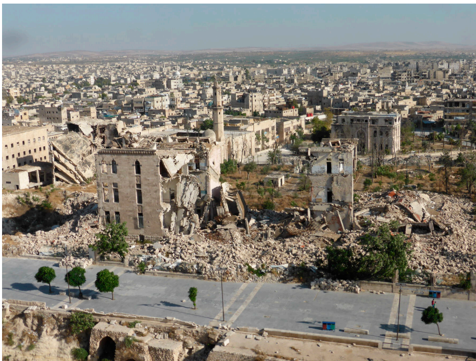
Figure 10.5 The destroyed New Saray.

against the Syrian government, which have prevented foreign investment and the transfer of resources to the country. 37