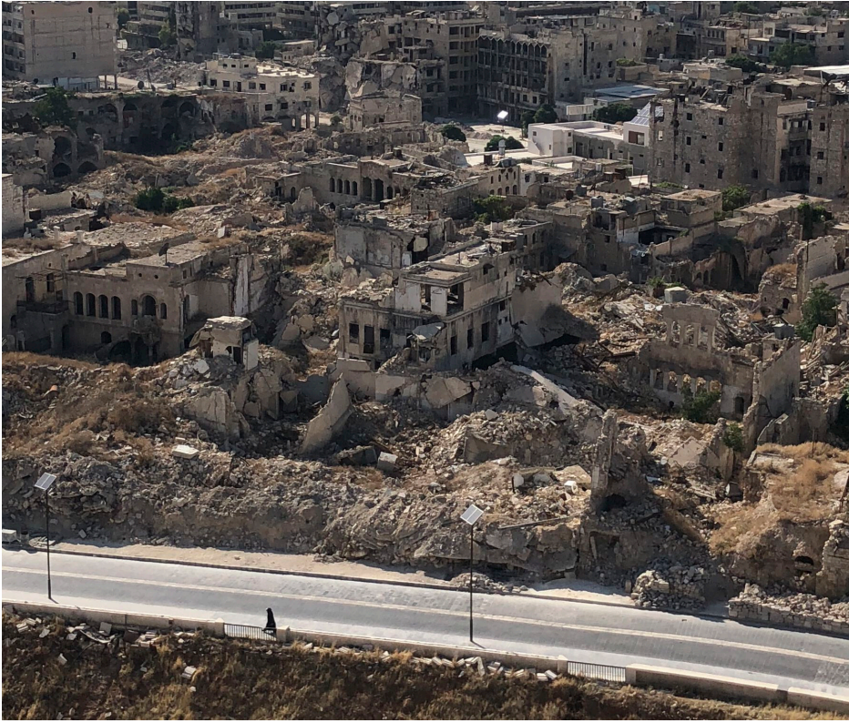
Figure 10.2 Destruction in Aleppo: The area near the citadel.

observers, and scholars 11 have attempted to collect information from the conflict areas, enabling an understanding of its evolution and its impact on the population, on the city's infrastructure, and on its heritage. 12 The war can be schematically divided into four phases, each of which is discussed in turn: the opposition takeover of Aleppo (2012–13), the reaction (Operation Northern Storm, 2013–14), the war of attrition (2015), and the retaking of the city (2016).